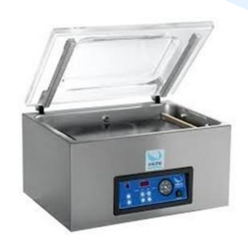
VACCUM PACKING MACHINE