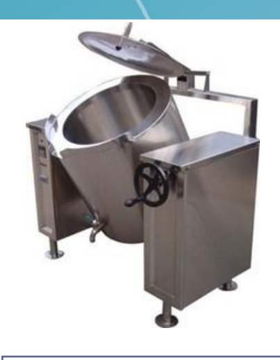
TILTING RICE BOILER/BULK COOKER