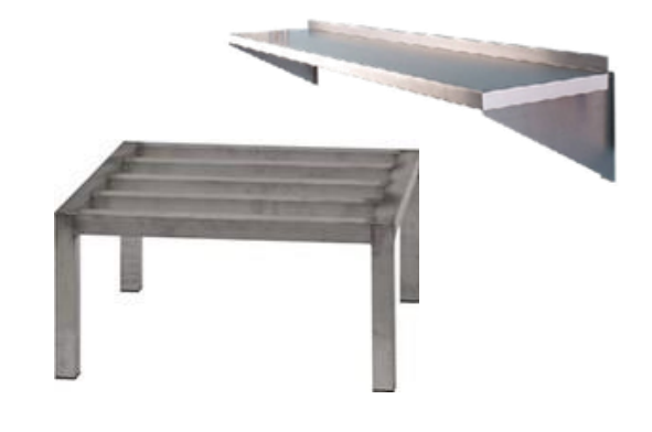
WALL SHELF & DUNNAGE RACK