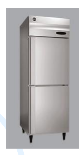
TWO DOOR REGRIGERATOR