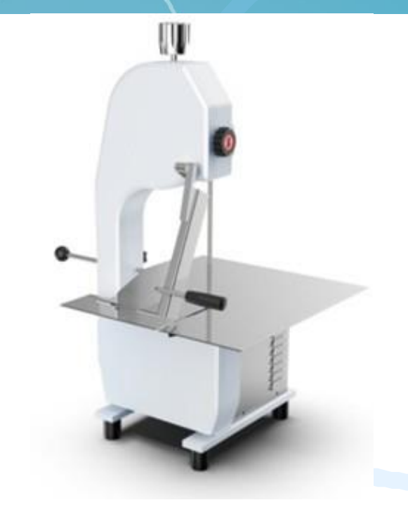
BONE SAW MACHINE