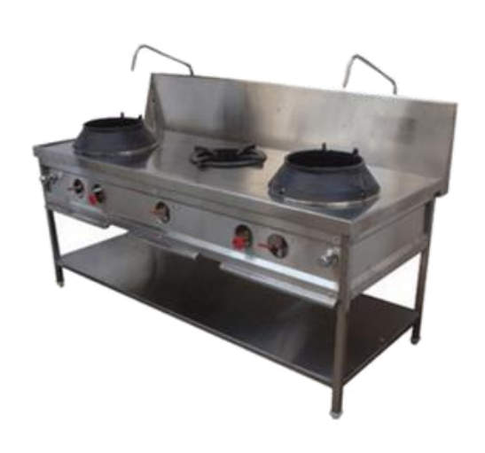
CHINESE WOK RANGE