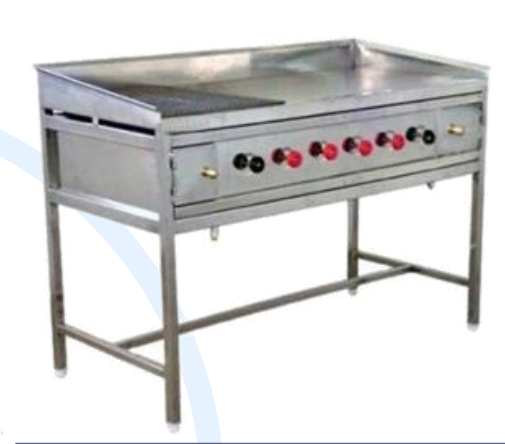
CHAPATI PLATE CUM PUFFER