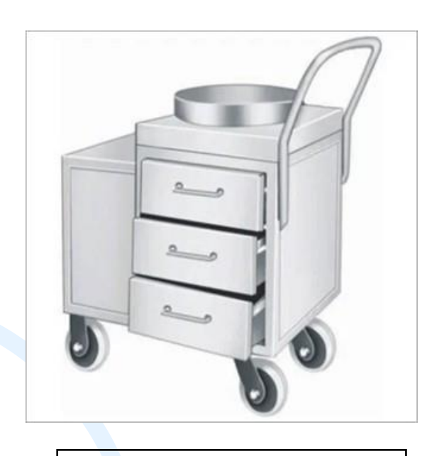
TEA SNACKS TROLLEY