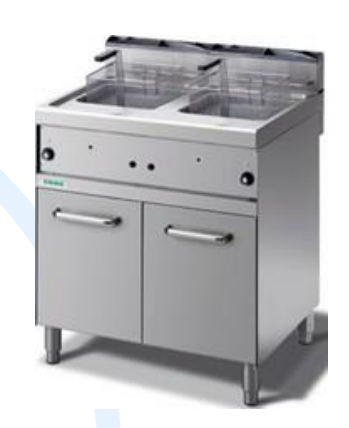
DEEP FAT FAYER