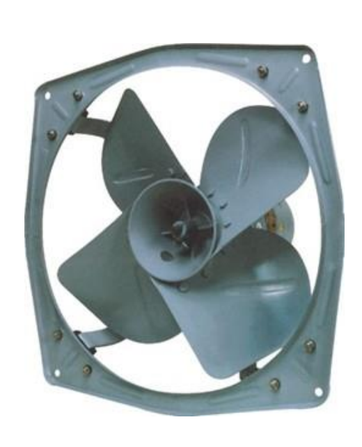
CENTRIFUGAL BLOWET UNIT