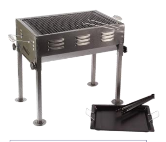
BAR BE QUE