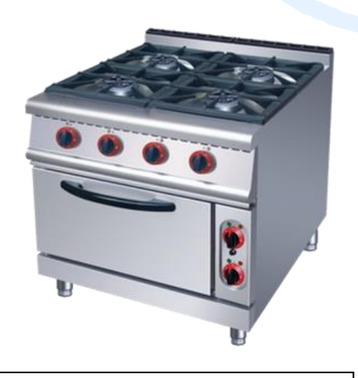
FOUR BURNER WITH OVEN