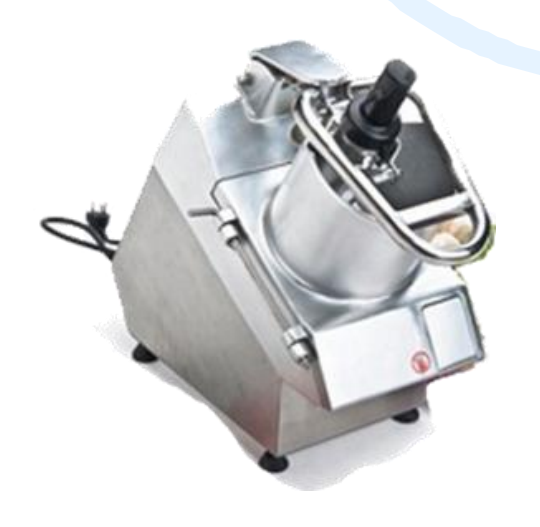
VEGETABLE CUTTING MACHINE