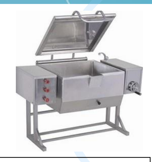
TILTING BRAISING PAN