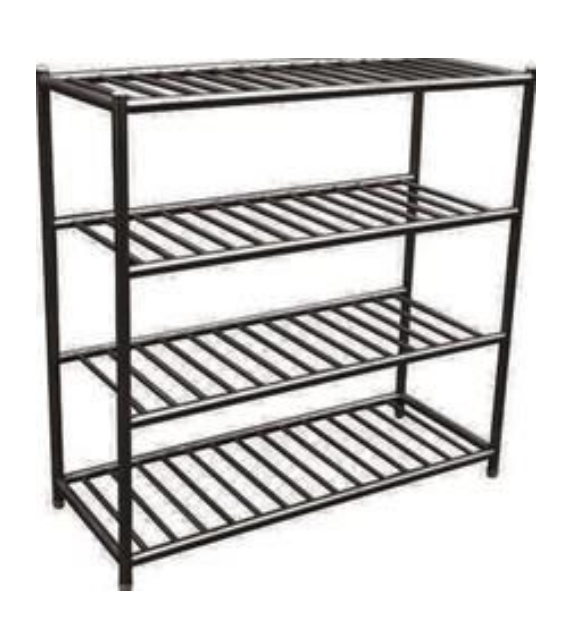
SS POT RACK