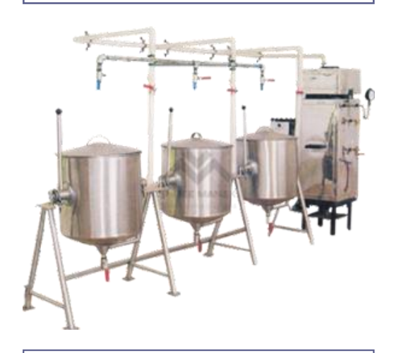
STEAM COOKING VESSEL