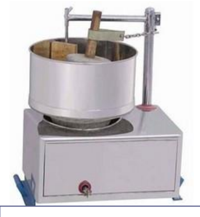
WET MASALA GRINDER