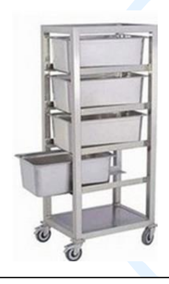
GN PAN TROLLEY