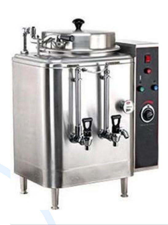
TEA COFFEE DISPENSER