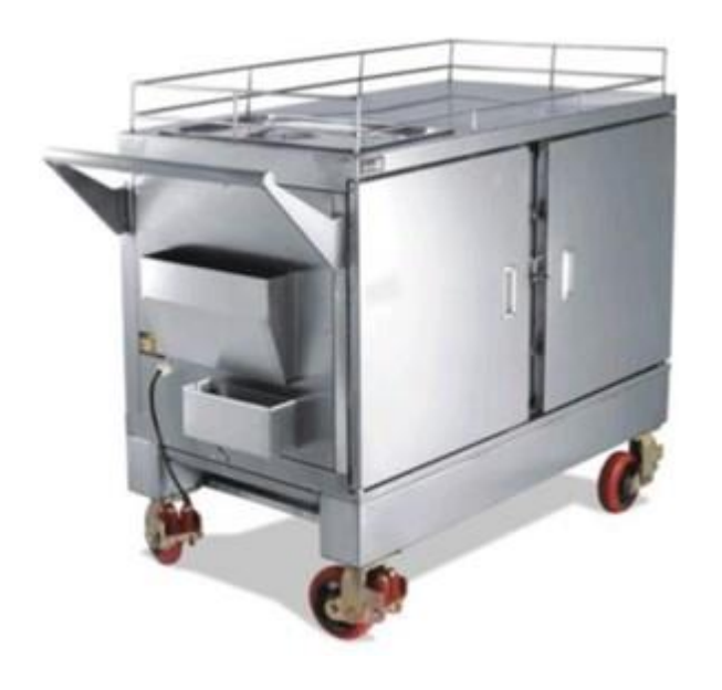
HOT FOOD SERVICE TROLLEY