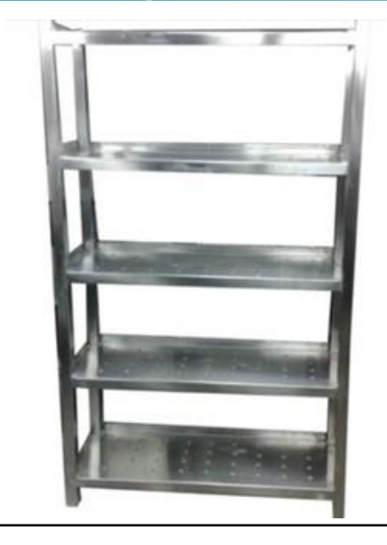
CLEAN DISH RACK