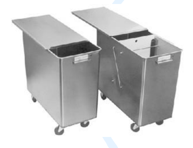
SS INGREDIENT BIN