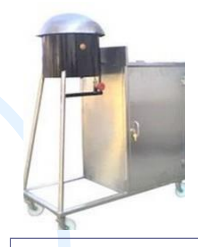
MOBILE ROOMALI ROTI