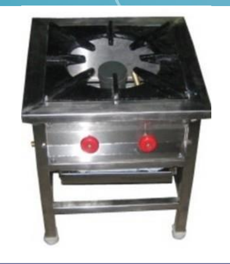
STOCK POT STOVE