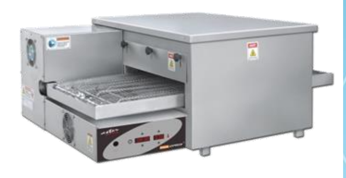
CONVEYER TYPE PIZZA OVEN