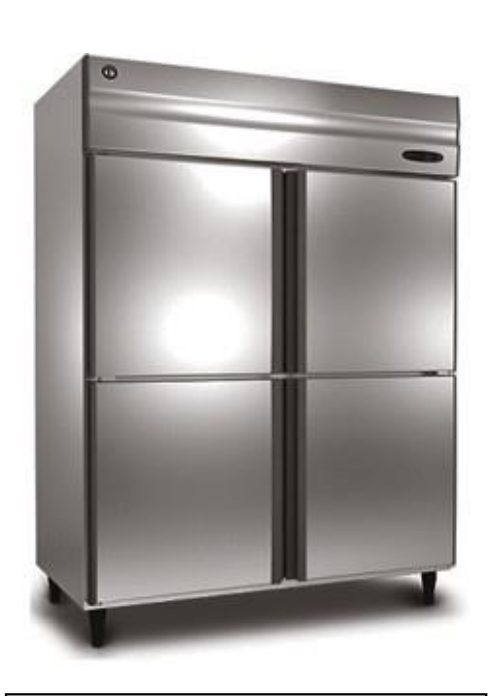
FOUR DOOR REFRIGERATOR