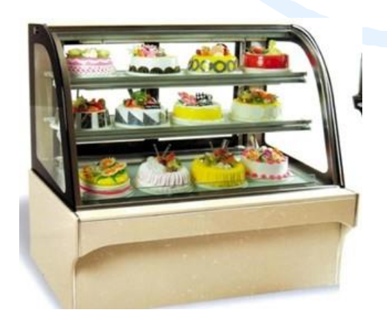
COLD DISPLAY COUNTER WITH CURVED GLASS