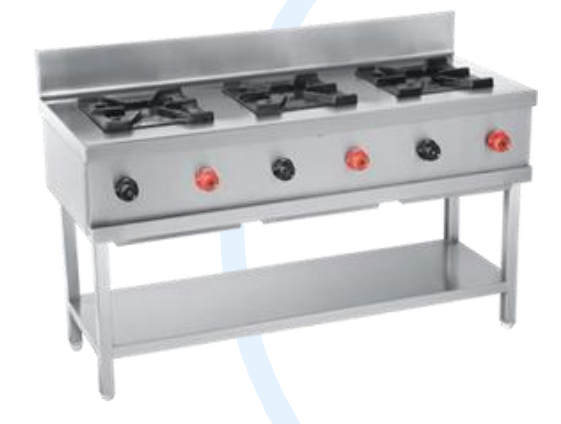
THREE BURNER RANGE