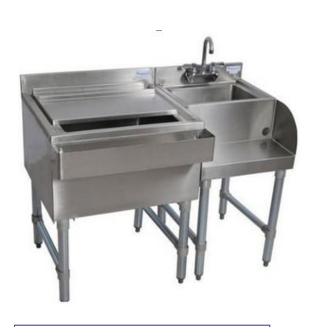
BLENDER STATION WITH SINK